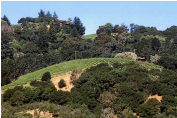
Rapley Trail Vineyard

The Rapley Trail Vineyard was planted in 1981, consisting of six contiguous acres of Pinot Noir vines on our Estate's rugged southeastern slopes. It has long been the backbone of our past "Estate Reserve" Pinot Noir, but beginning in 2002 we have begun to bottle portions of the vineyard separately (blocks). This "deconstruction", if you will, of the vineyard as a whole is based upon the model of Burgundy, home of the world's finest Pinot Noir wines. There, as in our vineyard, unique aspects and interactions of soil and climate account for grapes whose very flavor is a direct product of where they are grown; this is the essence of the terroir.