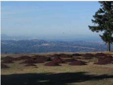
Pre-compost pomace (skin and stems) from the 2008 harvest.

TFW has been taking steps to preserve our planet. Over the years we have been using as much recycled packaging materials as possible and have changed our wine bottles to a lighter weight glass, which is less of an overall carbon imprint to our mother earth. We are currently taking steps to make our vineyard certified organic (this is a five year process). We've started composting and now we're going paperless!