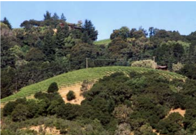
Rapely Trail Vineyard

We ferment all of our Pinot Noir in small lots, ranging from .5-3 tons. We utilize between 25-50% whole clusters and ferment the wines without the addition of yeast. Our maceration period lasts from 14-21 days, including a 3-7 day cold soak. We separate the press fraction at the press, this allows us to decide on its inclusion at a later date. We age our Pinot Noir in 3 year air dried French Oak from the forests of Bertranges, Allier and Tronçais.